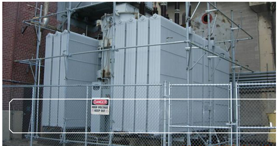
After: Trantech Manifold and Radiator Assembly—no fans or pumps